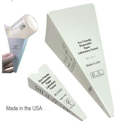
Made in the USA

Eco-smartFunnels funnels are widely used in sample collection tasks such as sputum collection for Covid-19 testing.