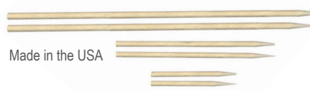
Made in the USA